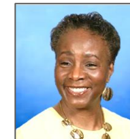
By Jackie Swift